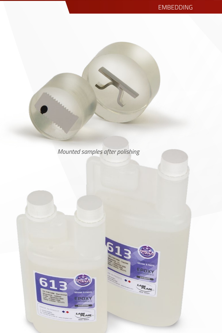
Mounted samples after polishing