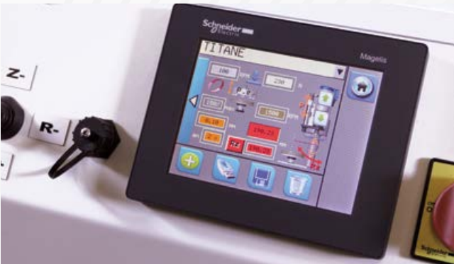
The 5.7 inch touch screen