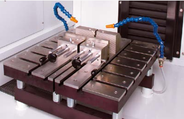
A spacious cutting chamber: W 408 x D 422 mm with openings on both right and left sides for the cutting of long samples.