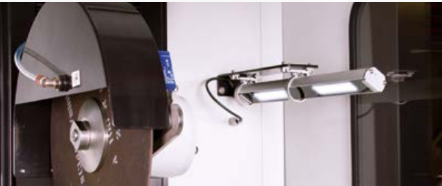
Work area lit by LED strip

A high-capacity, independent cooling/recirculation system (140 litres) is located under the machine. The multipoint nozzles insure excellent cooling of the sample and the cutting wheel even during intensive use.